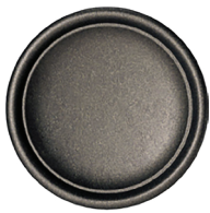
STEPPED ROUND KNOB – ANVIL