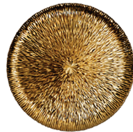
TEXTURED ROUND KNOB – FRENCH BRASS