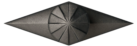
DIAMOND PLATE KNOB – ANVIL