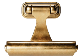
CURVED BAR PULL – FRENCH BRASS