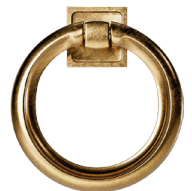
GROOVED RING PULL – FRENCH BRASS