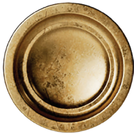
TRADITIONAL CONCAVE KNOB – FRENCH BRASS