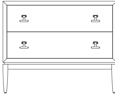
BAA6508 MERCER CHEST