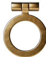
CLASSIC RING PULL – FRENCH BRASS