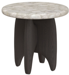
MCA4058, The Wild Elephant's Side Table

Standard Finish: Brown Petrified Wood with Fossilized Brass Legs