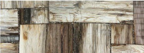
Brown Petrified Wood