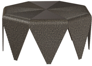
MCA4035, The Peccary's Table

Multifaceted and richly textured, The Peccary's Table is inspired by the spiky, patterned coats of the peccaries found in South America. The table is entirely clad in a fossilized brass finish, lending it a rich sculptural presence with a warm, luminous finish.