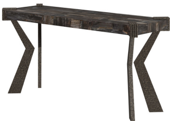
MCA4065, The Gibbon's Console

Standard Finish: Brown Petrified Wood with Fossilized Brass Legs