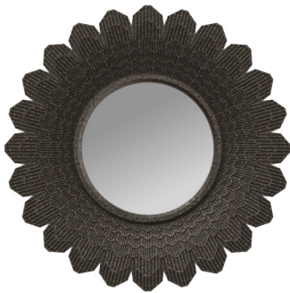
MCA4012, The Pangolin's Mirror

Standard Finish: Umber Optional Finishes: Type 1, Type 2 and Specialty Rattan