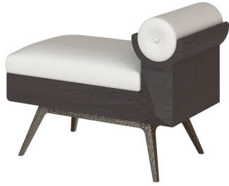
MCA4105B, The Serow's Banc

Inspired by the serow, an antelope-like animal with narrow legs, The Serow's Banc is an artfully modern take on a traditional bench. Oak, fossilized brass finish and upholstery combine to create an exceptional option for an entryway or living space.