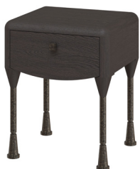
MCA4008, The Serow's Chevet

Standard Finish: Crystal White Agate Top with Char Base Optional Finishes for Base: Finish Program (Tier 1, Tier 2, Tier 3 and Tier 4)