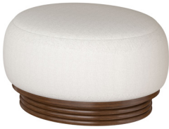
MCA4104O, The Wild Elephant's Pouf

Standard Finish: Char with Fossilized Brass Legs Optional Finishes: Finish Program (Tier 1, Tier 2, Tier 3 and Tier 4)