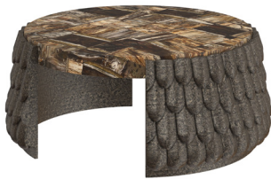
MCA4054, The Pangolin's Cocktail Table

Standard Finish: Crystal White Agate Top with Char Base Optional Finishes for Base: Finish Program (Tier 1, Tier 2, Tier 3 and Tier 4)