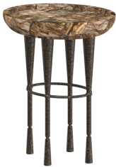
MCA4057, The Tiny Serow

Introducing The Bill Bensley Collection for McGuire, a celebration of natural beauty that supports the Cardamom Mountains rainforest in Southeast Asia. Each piece is inspired by rare and threatened wildlife in the region, taking cues from their shaping and personalities to create exceptional modern furniture. A respect for craftsmanship and natural materials flows throughout the collection, such as black and brown petrified wood, crystal white agate, sandblasted oak, and rattan carefully steamed and hand-woven by artisans. 100% of the funds raised from exhibitions, art classes and collaborations goes to the Shinta Mani Foundation, raising awareness for the plight of the forest and the beautiful creatures that live within.