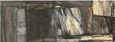
Black Petrified Wood