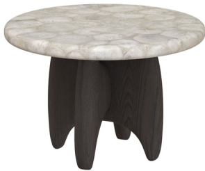
MCA4051, The Wild Elephant's Cocktail Table

The Wild Elephant's Cocktail Table has the robust presence of its namesake, with four distinctive feet made from cast resin and a smooth crystal agate top. Designed to be used in multiples and can be stacked with the coordinating side table.